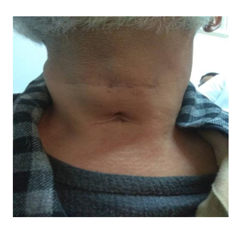
Figure 5: Scar of horizontal incision of tracheotomy compared to horizontal incision for vertical partial laryngectomy.