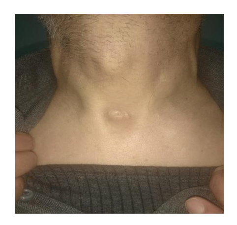
Figure 4: Scar after percutaneous dilatational tracheotomy.