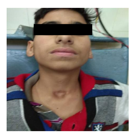
Figure 3: Tracheostomy scar in a 12 year boy who underwent elective tracheotomy at the age of 7 years (horizontal incision).

stays in place and cosmetically satisfactory results of horizontal incision are appreciable only when the tube is removed within few days, otherwise a 1cm vertical scar is unavoidable even when the horizontal incision is used and chi-square test p value of <0.045 negates the hypothesis that horizontal incision always gives a cosmetically better scar but further long term studies with large number of participants are needed to further confirm the results as for the time being the present pilot study points towards that approaches for tracheotomy using horizontal incision takes longer surgical time and may not necessarily yield the expected linear scar in the skin crease and the traditional vertical incision holds its place as approach of choice in emergency and difficult situations.