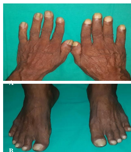
Figure 3 (A and B): Clubbing in upper and lower limbs.

and supraglottic larynx as well. The patient was taken for laryngotracheobronchoscopy and biopsy. Bronchoalveolar lavage was taken for smear and cytology. Smear was positive for acid fast bacilli. Cytology was suggestive of well differentiated squamous cell carcinoma. Biopsy from epiglottis revealed Langerhan's cells with carcinoma, necrosis and no atypia. Hence, the final diagnosis was "coexistent left bronchogenic carcinoma and pulmonary tuberculosis with laryngeal tuberculosis with contralateral neck node metastasis". Unfortunately, during the treatment planning, the patient became hemiplegic and MRI brain suggested metastasis in brain parenchyma. Eventually, the patient had a cardio-respiratory arrest and died.