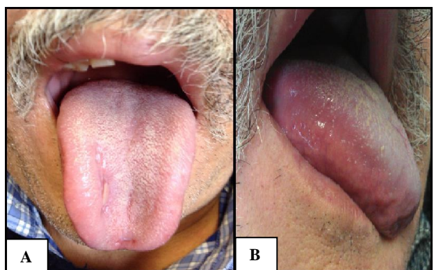
Figure 2: (A and B) Ulcers after nicorandil discontinuation.

He had been medicated with long-standing nicorandil; however he had increased the dose to 40 mg twice/day one month before the urge of lesions. He was treated with topical corticotherapy and anti-fungal drugs that were unsuccessful. The objective examination revealed three lesions: a major on the dorsal right face of the tongue, thready, 2 cm of major axis, well-defined edges, smooth, with soft consistency on palpation and painful; other two