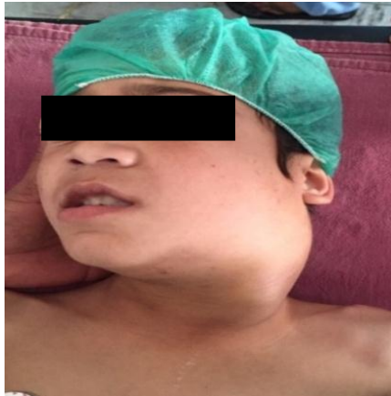
Figure 1: Extent of swelling in neck.

Routine blood investigations were normal. CT scan of the neck revealed highly vascular lesion with a differential diagnosis of ICA pseudo aneurysm, arterio venous malformation (Figure 2).