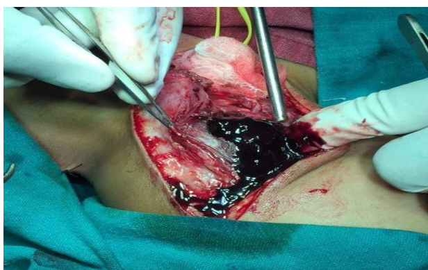
Figure 3: Blood clots.

Child had to be shifted to pediatric intensive care unit (PICU) preoperatively in view of worsening of respiratory distress. In consultation with vascular surgeon child was taken up for neck exploration after counselling attenders regarding post-operative complication which included neurological deficits, seizures, mechanical ventilation.