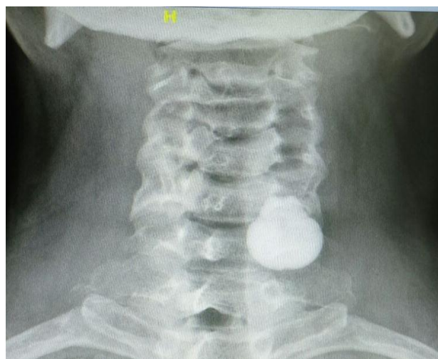
Figure 1: Plain x-ray soft tissue neck AP view showing pear shaped radiopaque foreign body in left pyriform fossa region.

body in the left pyriform fossa (Figure 1). X ray chest, abdomen and pelvis was within normal limits.