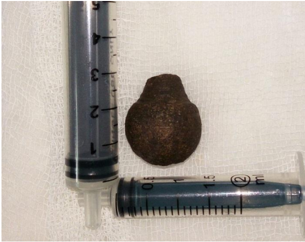
Figure 2: Recovered foreign body - 3×1.5 cm in case 1.

was removed with large foreign body removal forceps. The foreign body was a pear shaped smooth surfaced-“pebble” -measuring 3×1.5 cm (Figure 2). Postoperative period was uneventful and he was discharged the next day after psychiatric counseling.