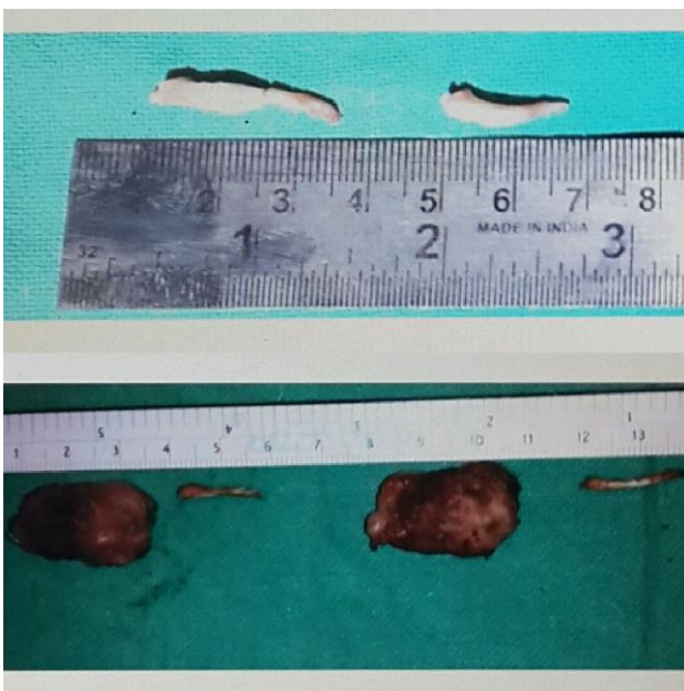
Figure 4: Tonsillostyloidectomy specimens.