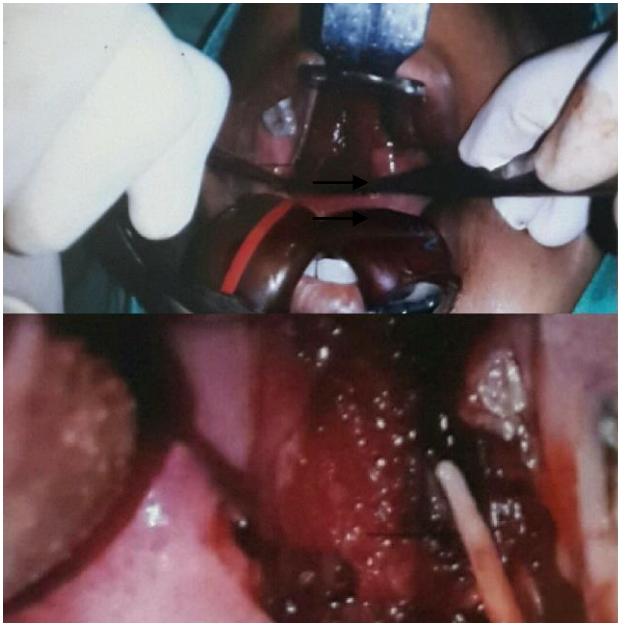
Figure 3: Bilateral styloid processes in tonsillar fossa (arrow).

styloid was smoothened with help of rasp. After confirming hemostasis, 2-0 vicryl was used to approximate separated fibres of superior constrictor muscle so that no dead space remains (Figure 5). The procedure was repeated on opposite side in bilateral cases. All patients were discharged in 3-4 days and advised oral antibiotics and anti-inflammatory along with antacids and prokinetics. Patients were followed up at 1 week, 2 weeks, 4 weeks and 12 weeks.