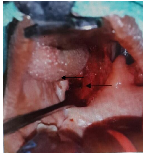
Figure 5: Sutures applied to superior constrictor fibres (arrow).