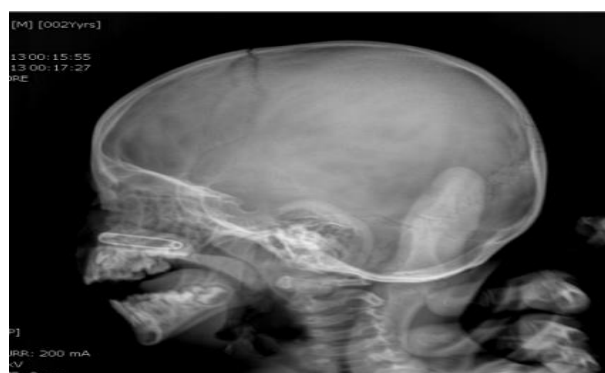
Figure 5: X-ray safety pin.