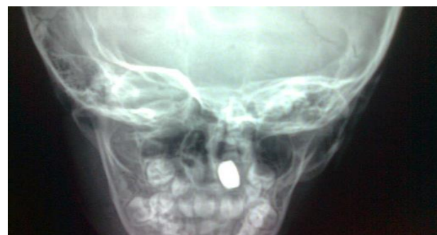
Figure 2: X-ray left nasal button battery.