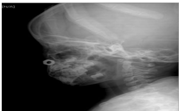
Figure 4: X-ray bolt.