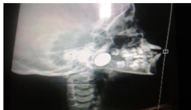
Fig 3: X-ray marble.