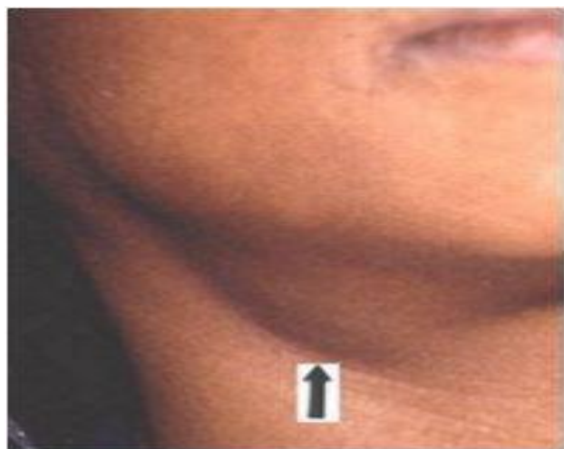
Figure 1: Submandibular swelling.

adenoma vs cellular pleomorphic adenoma USG neck s/o 3×3.5×2.8 cm sized hypoechoic lesion right submandibular of the swelling. Right Side submandibular gland excision was done & specimen sent for histopathology. Biopsy report gives a final diagnosis of papillary carcinoma favouring metastatic mass postoperatively USG neck was done which revealed few tiny nodules in both the thyroid lobes. USG guided FNAC of the thyroid gland revealed inconclusive report. Patient subsequently underwent total thyroidectomy with right side MND type 3 (level I-V) along with bilateral Central compartment clearance. Specimen was sent for histopathological examination. Biopsy report gives a final diagnosis well differentiated papillary carcinoma with extra nodal extension and one of the four nodes shows metastasis without perinodal invasion. Postoperatively, on examination no abnormality in the thyroid, breasts, lungs, or abdomen found. Mammography of both breasts and ultrasound of the abdomen were normal. In radionuclide thyroid scan no active foci seen.