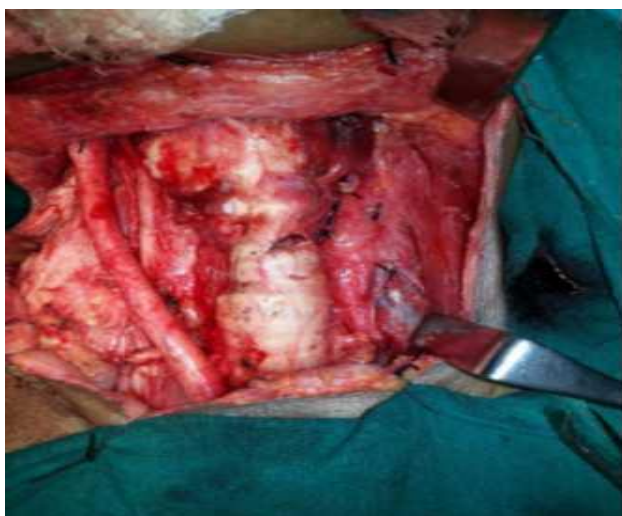
Figure 2: Intraoperative total thyroidectomy.

After six weeks and radio-ablation was performed. At follow-up, no residual tumor in the neck and no distant metastases were found. The patient is well without recurrent or metastatic disease after a year follow up.