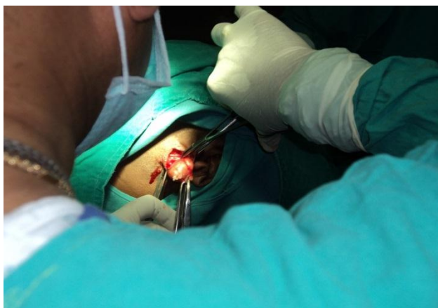
Figure 2: Showing the surgical approach.

Patients with dermoid cyst in the parotid region and pre auricular region underwent excision through standard parotidectomy approach (Figure 2). In case of epidermoid cyst over the maxilla, sublabial approach was followed. In case of dermoid cyst over forehead and posterior triangle an elliptical incision was made and the cyst was dissected.