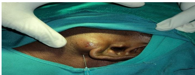
Figure 1: Clinical picture showing swelling in the parotid region.

Dermoids and epidermoids are inclusion cysts that are lined by stratified squamous epithelium with variable amount of pilosebaceous units and sweat glands supported by fibrous connective tissue wall. 1 Both arise from trapped pouches of ectoderm, near normal folds or from failure of surface ectoderm to separate from the neural tube. These slowly expanding, unilocular cystic masses are usually asymptomatic or may produce mild symptoms. 2