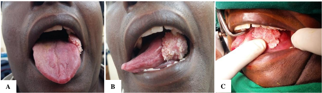
Figure 1 (A-C): Images showing the lesion over the dorsum and left lateral border of the tongue.

Rest of the examination of oral cavity was normal. No palpable lymph nodes in the neck.