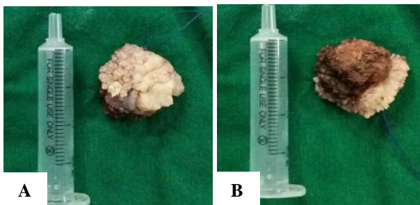
Figure 3: Surgical specimen showing a cauliflower like mass.

Histopathology revealed tumour of squamoid nature, with marked acanthosis, hyperkeratosis and elongation of rete ridges. Tumour cells showed large vesicular nuclei with nucleoli. The dermis showed marked lymphocytic