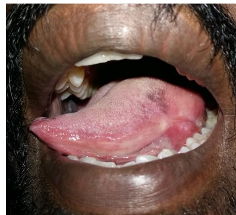
Figure 5: Postoperative image at 6 months showing healed wound.

Patient is on regular follow up every 3 months and is disease free till date.