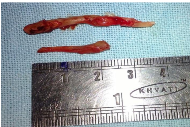
Figure 6: removed specimen of styloid processes.