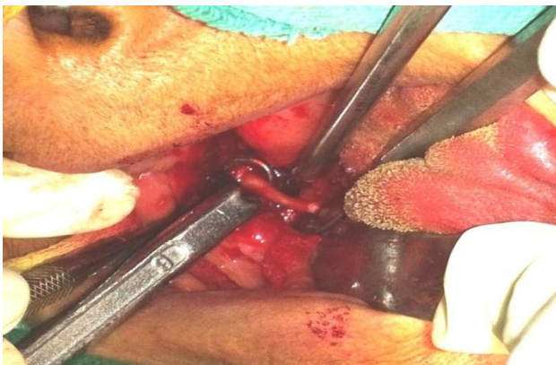
Figure 5: Use of custom milled spanner tool in surgery.