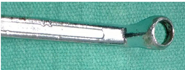
Figure 4: Custom milled spanner tool.