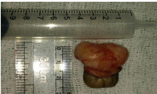
Figure 3: Excised specimen.