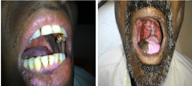
Figure 3: Submental island flap for retro molar area and tongue reconstruction.

then transferred and attached to the recipient site (Figure 1), and donor site closed primarily in layers (Figure 2). In Figure 3 submental Island flap used for retro molar area and tongue reconstruction submental island flap in contraindicated in gross level 1a and 1b nodal metastasis, low volume disease can be meticulously removed preserving pedicle.