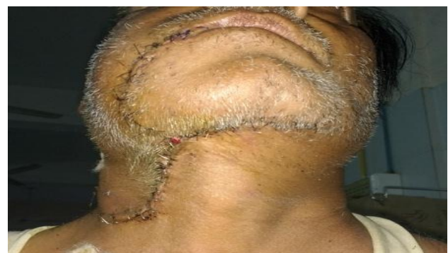
Figure 2: Primary closure of donor site.

Use of a Doppler probe can be helpful at this point. After identifying the submental vessels, the anterior belly of the digastric muscle is released from its attachments and elevated with the flap because the vascular pedicle passes deep to this muscle in most cases (Figure 1). 8 Harvesting the flap is continued by carefully releasing the submental artery and the vein from the surrounding tissues during their course between the submandibular gland and the mandible. The surgeon should take special care not to separate the skin paddle from the submental vessels and not to injure the marginal mandibular nerve at this point. The dissection should be discontinued when sufficient length of vascular pedicle is obtained or the junction of the submental and facial vessels is reached. The flap is