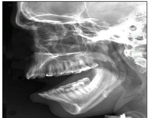
Figure 3: Lateral radiograph of TMJ confirmed diagnosis.