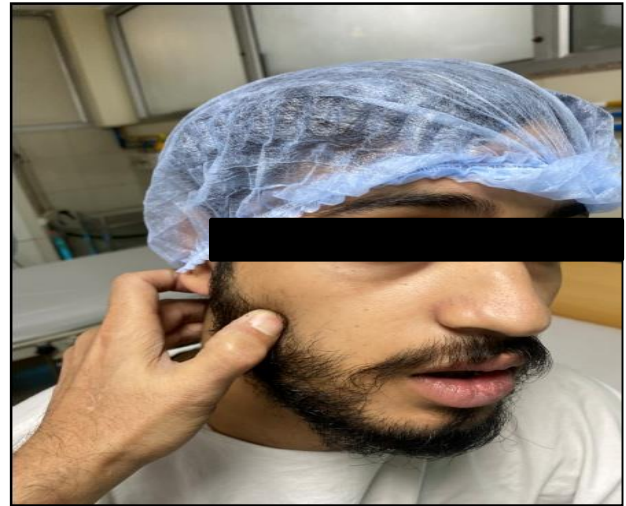
Figure 2: Coronoid process protruding on right side.

Under xylocaine 10% spray, the pre auricular area and the cheek was palpated and the ascending ramus of the right side was encircled between the left thumb, placed on the coronoid process and the other fingers on the posterior border, A similar placement was carried on the other side. A clockwise torque was applied, with more force on the left coronoid process. Thereby the left condyle slid over the articular eminence into the glenoid fossa with a 'click', thereby completing the reduction. The joint on the other side was at its normal articulation. The mouth could be easily closed with proper occlusion of the incisors; with the prominence of the coronoid process becoming imperceptible (Figure 4 and 5).