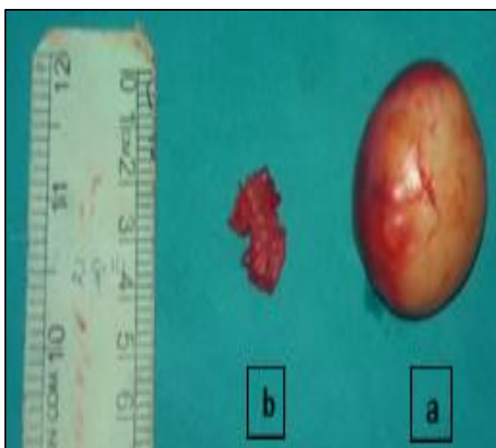
Figure 3: (A) and (B) Specimen.

The second swelling was located in the midline of the neck just inferior to the hyoid bone. It measured about 1x1 cm, was non-tender, firm in consistency, and moved with deglutition and on protrusion of the tongue. Ultrasound of the neck was done and the findings were confirmed by an MRI scan. Both showed a well-defined cystic lesion measuring 3.7x3.3x4.3 cm on the left side behind the left submandibular gland and inferior to the left parotid gland (Figure 1). It was partially extending into the gap between the internal and external carotid arteries soon after their bifurcation, suggestive of type 3 second branchial cleft cyst. Laterally it was limited by the sternomastoid muscle. The internal jugular vein was compressed postero-medially by the lesion.