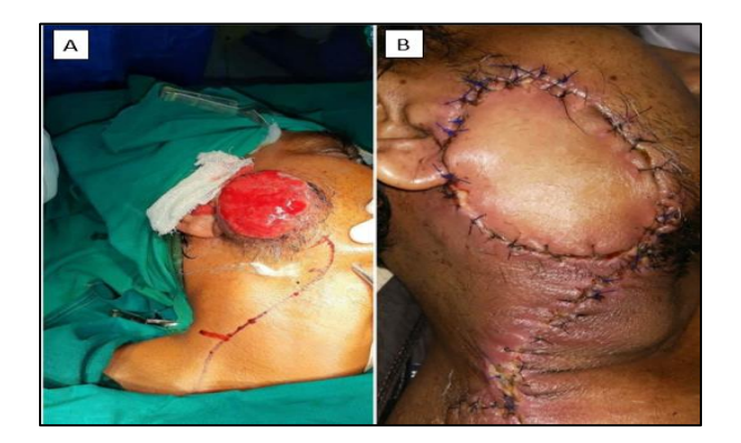
Figure 3: (A) Pre-operative section. (B) Reconstruction with PMMC flap.

Chest CT and Sonography of the abdomen and pelvis region were performed, which did not support the diagnosis of a primary lung or Gastrointestinal tumor. The patient went on to undergo radical surgery, which