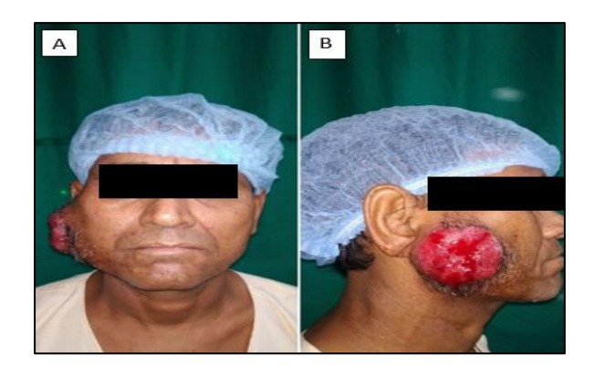
Figure 1: (A) Frontal profile. (B) Right lateral profile.

adenocarcinoma, undifferentiated carcinoma and metastatic carcinoma were all included in the differential diagnosis.