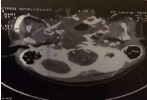
Figure 1: CT scan: aggressive nasopharyngeal tumour eroding the skull base.

right carotid artery and extension of the mass into the cavernous sinus. Trans-nasal biopsy was done, histology revealed carcinosarcoma of the nasopharynx. The tumor was inoperable. Curative radiotherapy (77 gray) was given but appeared ineffective. The patient demised shortly thereafter.