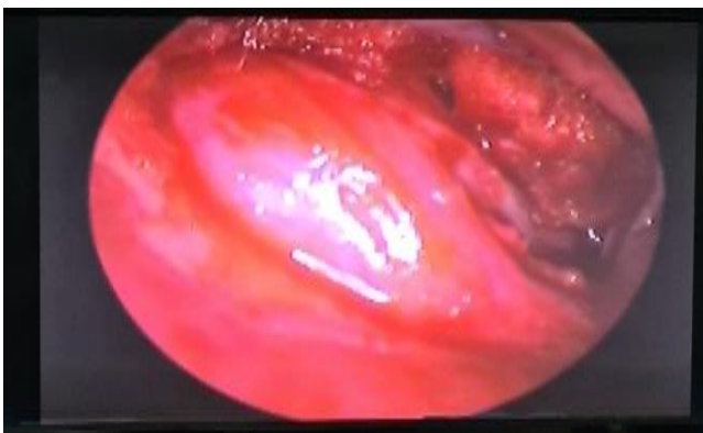
Figure 2: Tenting of lacrimal sac.