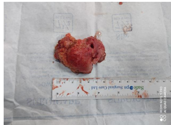
Figure 4: Tissue specimen sent for histopathological examination.