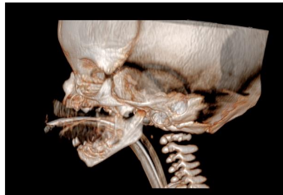
Figure 2: Lateral view in 3-D reconstruction with absence of the nasal bones.

A karyotype was performed, which was reported as 46, XY with no numerical or structural alterations. A transfontanellar and abdominal ultrasound, echocardiography and plain CT of the paranasal sinuses were requested. On the transfontanellar ultrasound, increased periventricular echogenicity was reported as the only finding. On the abdominal ultrasound, bile sludge was reported as the only finding. The transthoracic echocardiogram did not show any structural or functional alterations. The plain CT of the paranasal sinuses showed absence of the anterior and posterior pyriform opening, absence of both nasal bones, the absence of ethmoids, both in their vertical and horizontal lamina and in the papyraceous lamina, absence of the nasal septum, observing a rudimentary nasal cavity occupied by material with soft tissue density, shown in Figure 2-4.