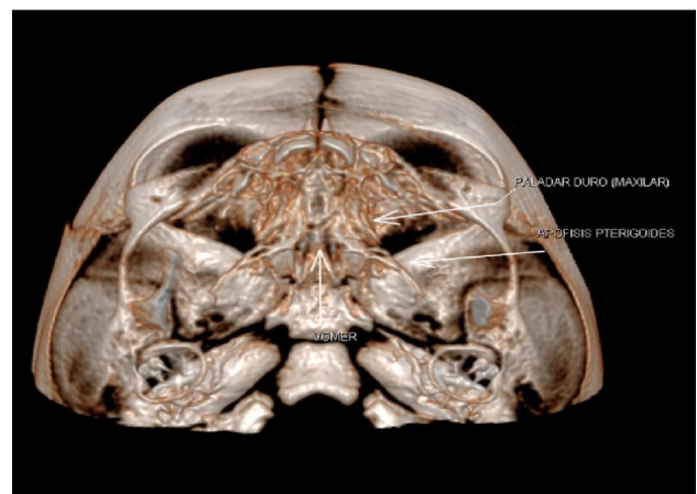
Figure 3: The hard palate is formed by the palatine process of the maxilla bilaterally, as well as rudimentary vomer bone.