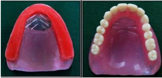
Figure 1: Fabrication of customized rugae maxillary complete dentures.

carefully and the mould was ready for pouring of the refractory material.