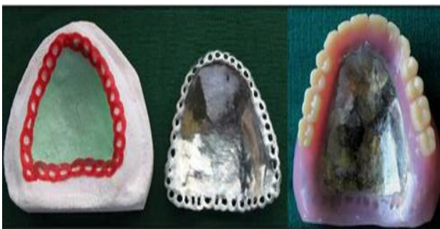
Figure 2: Fabrication of customized metallic base maxillary complete dentures.

Tacky liquid was painted within the confines of the proposed base. Retention meshwork wax pattern was adapted over the facial ridges along the confines and a stippled casting wax was adapted in the center of the palate. The excess was trimmed down with a No. 11 Bard Parker knife, the borders and the joint between the mesh and the palatal stippled surface were sealed with blue inlay wax. The cast was sprued and invested. Finally, the conversion of cast to record base was done by addition of polymerizing resin and the denture was flaked and processed further in conventional fashion as depicted in (Figure 2).