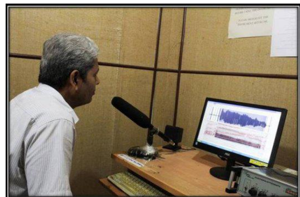
Figure 3: Acoustic analysis performed using PRAAT.