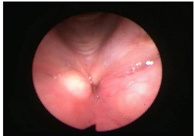
Figure 3: Small ventricular swelling in the right side on the anterior part.

A middle-aged man presented with a change in voice, pain, burning sensation, and foreign body sensation in the throat for 6 months. He had other symptoms of nasal block and snoring. Examination of the nose revealed deviation of the nasal septum to left. The indirect laryngoscopic examination was not possible due to excessive gag reflex. Flexible fiberoptic videolaryngoscopy was done which showed a small ventricular swelling on the right side in the anterior part of the larynx. The rest of the larynx and vocal cords were normal (Figure 3). A provisional diagnosis of a benign laryngeal tumor was considered. Considering the small size of the tumor and the benign appearance with intact mucosa, we directly proceeded with microlaryngoscopic excision of the tumor without a radiological confirmation. Suspension laryngoscopy was done under general anaesthesia. The small ventricular swelling was visualized and under microscopic visualization, it was excised precisely using microcup forceps and scissors. Histopathological examination of the specimen showed features of lipoma.