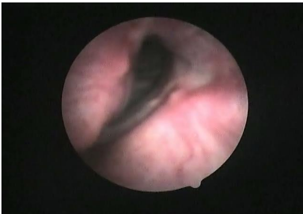
Figure 1: Flexible fiberoptic videolaryngoscopy showing ventricular fullness in right side.

well-defined fat attenuating lesion measuring 2.1×2.7×1.5 cm in the right paraglottic region causing bulging of the true cord. The lesion extended from the supraglottis to the glottis. Laterally it was limited by the thyroid lamina. Anterior commissure was free. Posteriorly it reached just upto the level of anterior margin of the cricoid cartilage. The right cricoarytenoid joint was involved and distorted. Few sub centrimetric lymph nodes were noticed. A diagnosis of paraglottic lipoma was considered. A preoperative histological diagnosis was not considered as a pre-requisite, firstly because of the location of the tumor, and secondly, a good diagnosis can be made with a densitometry-assisted CT scan. Microlaryngoscopic excision was planned using an operating microscope. The patient was taken to the operation theatre and a wide laryngoscope was used. After visually fixing the site of the incision (summit of the bulge), local infiltration was given with 2% lignocaine with 1: 2 lakh adrenaline. Then, the mucosa was cauterized to reduce the bleeding. 1.5 cm linear incision was made. By blunt dissection, using microlaryngeal instruments, the tumor was removed in toto. The histopathological analysis confirmed our provisional diagnosis of lipoma.