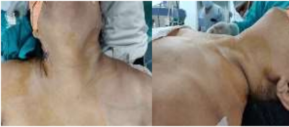
Figure 1: Preoperative pictures with no obvious neck swelling.