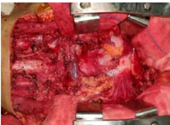
Figure 4: After complete removal of the goitre.