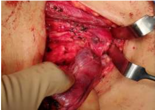
Figure 2: Cervical thyroid with fibrous band (thyro-thymic thyroid rest).