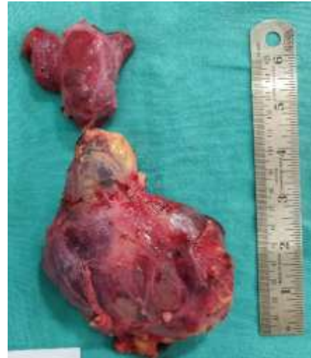
Figure 5: Specimen of the whole thyroid gland after complete resection of both neck and mediastinal parts.