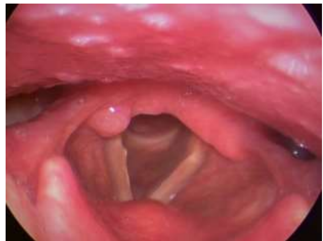
Figure 2: Laryngeal lesion on the posterior third of the right ventricular fold.

Once we had the histopathological result, we proceeded to discard any other related lesion in the head and neck region. We discovered a second lesion at the level of the posterior third of the right vestibular fold, with the same characteristics as the pharyngeal one. The lesion was well delimited, pale pink to yellow colour, round, with a 0.5 cm diameter (Figure 2). The patient presented no symptoms related to neither of the lesions. We did not identify any subglottic lesions and vocal cords had normal aspect and their movement and vibration was no impaired.