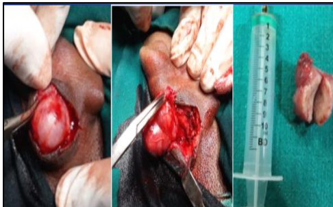
Figure 3: Intraoperative photograph showing well circumscribed smooth swelling with well-defined borders.

On examination, a single smooth spherical swelling of size 3×3 cm with well-defined edges and normal skin was noted in upper part of post-auricular region (Figure 1). On palpation, it was firm, mobile, non-tender, non-pulsatile, non-fluctuant with no trans-illumination.