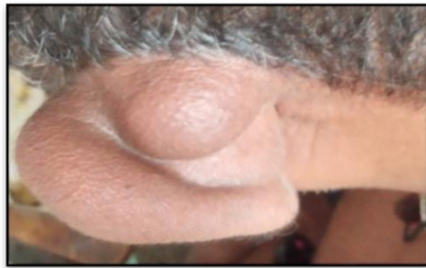
Figure 1: Presurgical photo- superior view of the post-auricular mass.

had pain over the swelling for past 2 months. There was no history of fever, sore throat, cough, ear discharge, weight loss or trauma. There is no relevant family history.