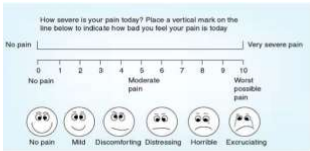
Figure.1. Visual analogue scale

Postoperatively, the pain was assessed in both the groups at 2, 6 and 12 hours using objective pain scale (OPS) in children less than 8 years and visual analogue scale (VPS) in those above 8 years.