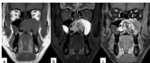
Figure 1: Cor T1WI (a) shows mass filling the left nasal cavity iso intense to the muscles, hyperintense on STIR (b) and shows heterogeneous post contrast enhancement (c) Convoluted cerebriform pattern is seen on STIR (b) and T1+C (c) images.

It appeared iso to hypointense to muscles on T1W as in Figure 1a, heterogeneously hyperintense on T2WI as shown in Figure 2a and STIR Figure 1b and showed early heterogeneous post contrast enhancement Figure 1c and 2b. On coronal STIR and coronal T1+C images, it showed a convoluted cerebriform pattern Figure 1b and 1c. This characteristic imaging pattern led us the diagnosis of an inverted papilloma.