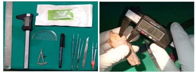
Figure 1: Instruments used and measurement procedure.

An electronic digital vernier calliper with least count of 0.01 mm, goniometer, unbraided silk thread for measuring the curved distances of the laryngeal cartilages, scale, protractor for measuring different angles, tooth forceps, divider.