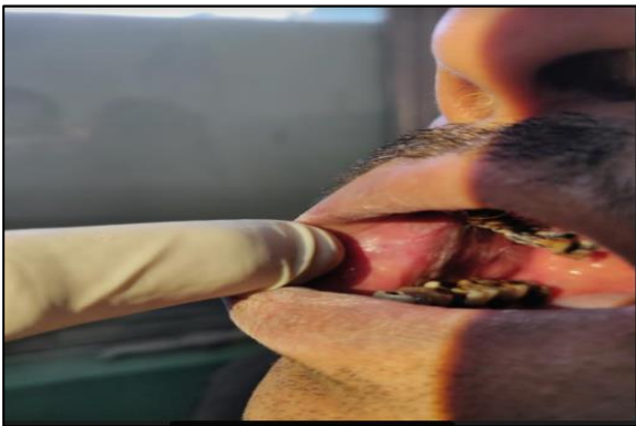
Figure 3: Patient 1-year post implant and salvage surgery.