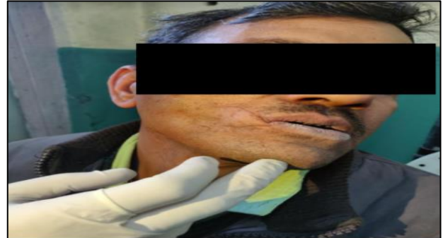
Figure 4: Patient 1-year post implant and salvage surgery.

CECT from base of skull to neck revealed a localised homogenous isodense mass lesion of size 3.9×2.3×2 cm in the right perioral region. Lesion apparently involved the right orbicularis oris levator anguli oris and zygomaticus minor.