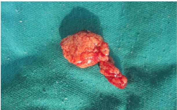
Figure 2: An intact pedunculated nasal mass was successfully excised. It was friable in consistency and weighed 17.4 gm.