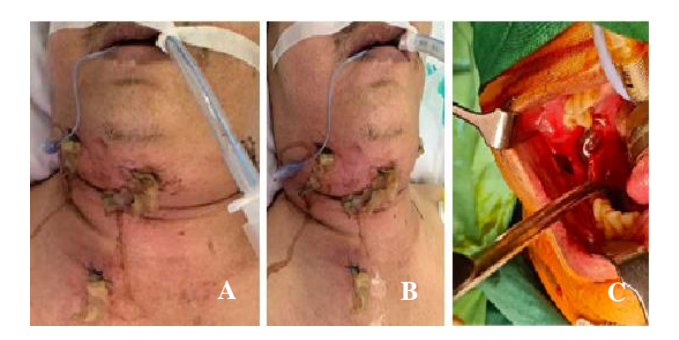
Figure 1: Intra-operative photographs demonstrating (A) the neck (B) chest (C) intra-oral incisions.

On arrival to the emergency Department, Mr E was febrile and drowsy with a glasgow coma score (GCS) of 9 (E3V2M4). 4 passive drains over his neck (3) and chest (1) and 3 intra-oral (right buccal mucosa, retromolar trigone and floor of mouth) incisions were seen from which purulent discharge was freely draining (Figure 1). Crepitus was felt over his neck and chest and on nasoendoscopy, his right tonsil appeared unhealthy and parapharyngeal walls edematous but airway was patent.