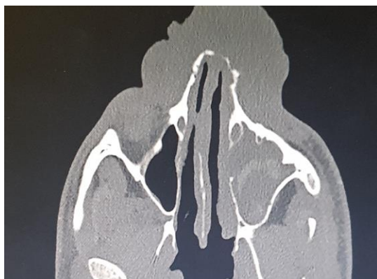
Figure 3: CT paranasal sinus showing opacification of left maxillary sinus with hyperdense contents and soft tissue thickening in bilateral premaxillary area.

Histopathological examination revealed broad pauciseptate hyphae, right angled branching, granulomatous inflammation in the dermis and subcutis,