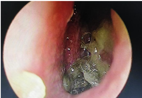
Figure 2: Diagnostic nasal endoscopy showing thick crust in nasal cavity.