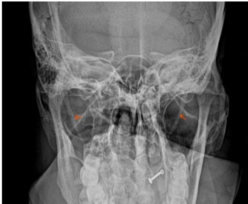
Figure 1: X-ray Towne’s view showing elongated styloid process.

A detailed note of all the symptoms was taken. All the subjects were examined clinically and the diagnosis was confirmed by digital palpation of tonsillar fossa and X-ray of towne’s view (Figure 1). In few subjects, dental opinion was taken to rule out unerupted third molar tooth. The procedure was performed by a single surgeon. Out of 17 subjects, 13 were performed under local anesthesia (LA) and 4 under general anesthesia (GA). All subjects underwent tonsillectomy and were followed by styloidectomy.