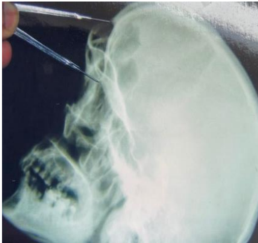
Figure 1: Plain radiograph lateral view skull, showing anterior and posterior frontal tables.

projection the paired sinuses are superimposed on one another and cannot, therefore be distinguished, indicated by MacKay and Lund. 11 The opacities or an air fluid level in the frontal sinus in plain radiographs of the paranasal sinuses are usually the result of disease processes in the frontal recess. Even with the extensive involvement of the frontal sinus the changes in the frontal recess appear to be slight and identified only by conventional tomography as reported by Stammler. 12