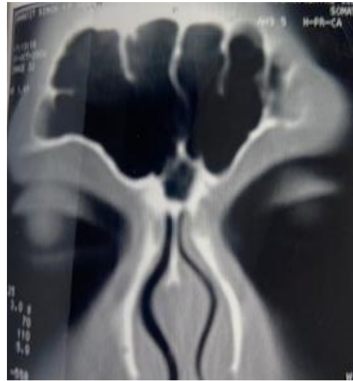
Figure 3: Coronal CT para-nasal sinuses showing scalloping in the well pneumatized frontal sinus.

processes cause reactive thickening or remodeling of adjacent bone. 13