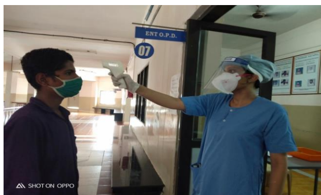
Figure 1: Thermal screening.

Figure 1 shows that thermal screening should be done for all patients entering ENT OPD along with hand hygiene and mask. This, ensures minimal exposure to staff and the patient. Patients having symptoms suggestive of COVID-19 were send to COVID-19 screening clinic for further evaluation. One patient at a time in ENT OPD, if possible, without attender. This enables other patients in ENT OPD are safe.