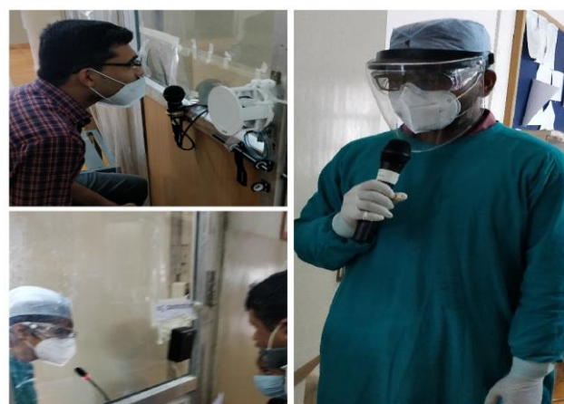
Figure 2: Two way communication strategy.

Figure 2 shows the adopted strategy of two-way communication through glass door via microphone communications. This technology allowed us to see patients with social distancing. Telecommunication was used for simple ailments.