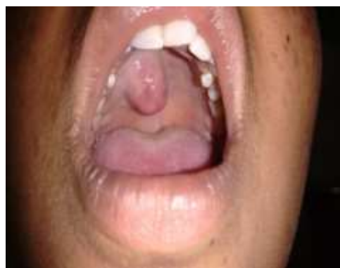
Figure 1: Hard palate mass.

midline of hard palate extending more towards right which had a hard periphery and soft center [Figure 1]. Anterior rhinoscopy revealed a smooth bulge at the junction of septum and the floor in the right nasal cavity.