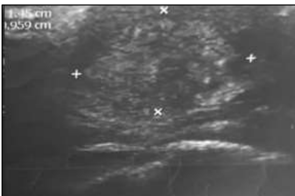
Figure 2: USG showing a cystic mass with heterogeneous echoes.