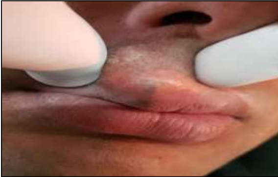
Figure 1: A solitary mass (1.5x1 cm) on right lateral esthetic unit of upper lip with shiny erythematous skin.

The mass was excised under local anaesthesia with a rim of normal tissue. Histopathological examination showed a lobulated mass with chondroid and myxoid stroma with epithelial and myoepithelial cells within lobules and nests (Figure 3 and 4). Necrosis and mitosis were absent. These findings were suggestive of chondroid syringoma. Patient was kept on follow up for 18 months and no recurrence was observed.