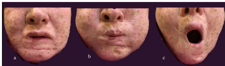
Figure 4: (a) Results of case 2, a year post-surgery and radiotherapy, at rest, (b) good oral competence, and (c) minimal microstomia, inter commissure distance of 4.0 cm.