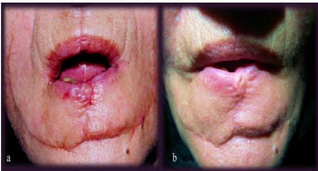
Figure 7: Case 3, (a) two months post-operative and (b) a year post-surgery and radiotherapy.