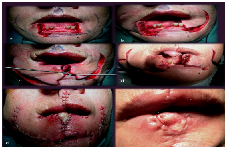
Figure 5: Case 3, (a) central lower lip defect of 80%, planned for bilateral K flaps, and Abbe flap from upper lip philtrum, (b) K flaps being dissected and raised, (c) attempting to mobilize K flaps, the requirement for a lip sharing with an Abbe flap is demonstrated, (d) Abbe flap has been dissected and raised in a shield shape, hanging from philtrum of upper lip with a small hidden pedicle. Its donor site been closed, (e) Abbe flap is been flipped, secured to K flaps, the lips are held together centrally with a bridge of the labial vessels supplying the Abbe flap. Burrow's triangles were also excised on both cheeks to facilitate rotation, and (f) division of Abbe flap at 3 weeks postoperatively and revision to the mucosal wounds.