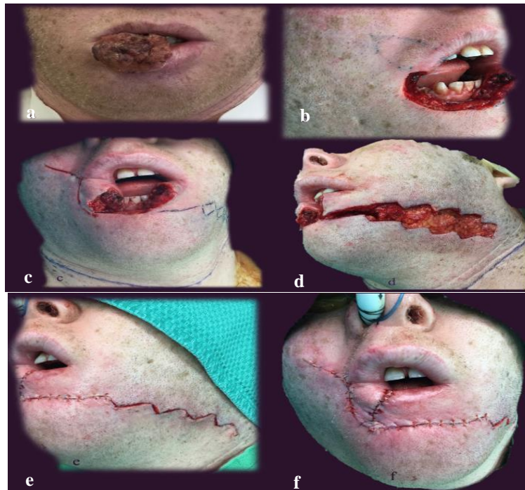
Figure 2: Case 2, (a) young adult with SCC, inter commissure distance of 4.5 cm, (b) 3.0 cm segment of lower lip and a commissure has been resected, E flap of good width been marked, (c) E flap has been raised and transferred, achieved a full commissure and reduced the gap considerably, an step-plasty has been marked on the contralateral side, (d) step-plasty planned from contralateral side, (e) closure donor site of the step plasty and (f) completion of reconstruction inter commissure distance 4.0 cm.