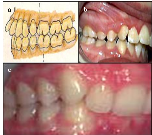
Figure 2: (a) Class II malocclusion, (b) class II division 1, and (c) class II division 2.

Occurs when the permanent first molars are in class II and the permanent maxillary central incisors are retruded (pulled backward toward the oral cavity) and tilting lingually.