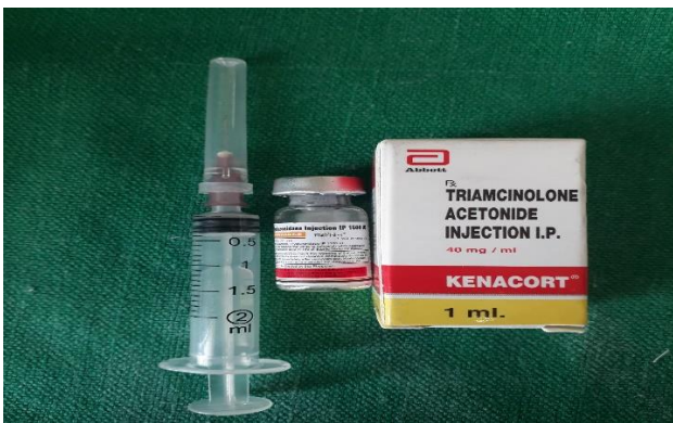
Figure 2: Injection triamcinalone 40 mg and hyaluronidase 1500IU with 2 ml syringe.

The 30 patients were treated with a combination of intralesional injections of triamcinolone 40 mg with hyaluronidase 1500 IU given in each sitting once a week for 6 weeks (Figure 2).