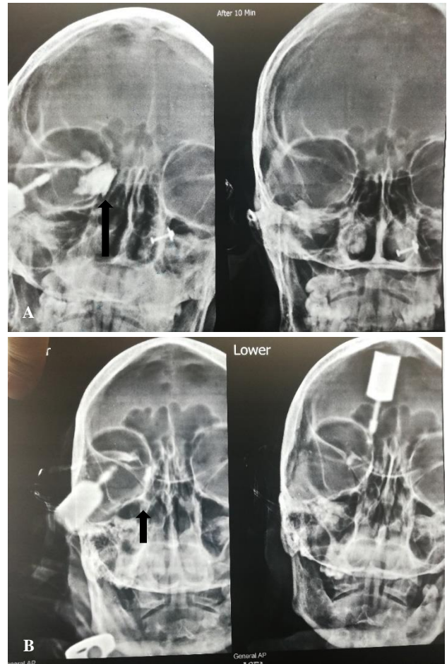
Figure 2 (A and B): Dacryocystographs (arrow marking the level of obstruction).