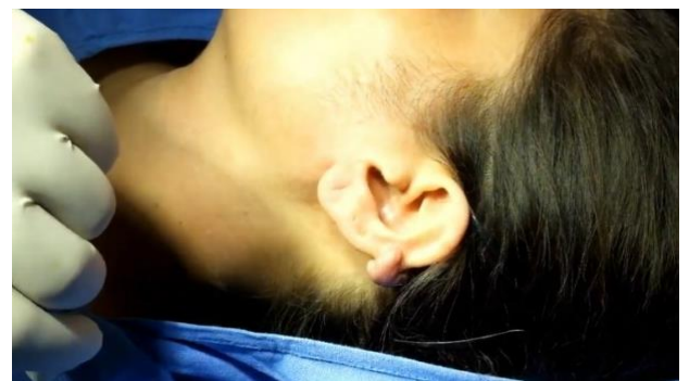
Figure 5: Before surgical excision followed by intralesional triamcinolone acetonide injection.