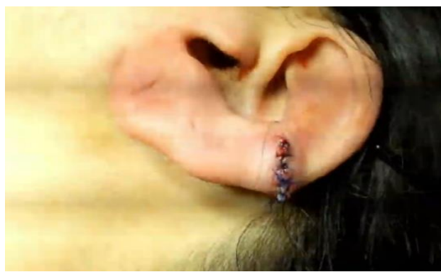
Figure 6: After surgical excision followed by intralesional triamcinolone acetone injection.

Several antineoplastic agents have been tried. Bleomycin has been used both intralesionally and with a multipuncture technique with good results. 7,8 Methotrexate has also been used but without benefit. Five-fluorouracil (FU), is a pyrimidine analogue with antimetabolite activity with promising results 9 . It has also been tried as a monotherapy in keloids but histologic evaluation and long-term follow-up were not available. Recent studies have evaluated 5-FU both clinically and histologically only in a limited number of patients with keloids and hypertrophic scars. 10