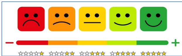
Figure 1: Likert's scale used for scoring post-operative appearance.

patients. Average scores were 4 and 3 for groups A and B respectively, which showed statistical significance ( p < 0.05 ). The reduced score in group B was mainly attributed to the initial scarring.