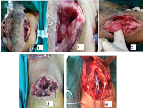
Figure 3: (a-c) Complete cricotracheal separation, (d, e) LT repair over endotracheal tube as stent.

Blunt injury patients who had severe respiratory distress, worsening of symptoms in terms of extending subcutaneous emphysema (Figure 1a and b) on conservative management and radiological and laryngoscopic evidence of dislocated arytenoid cartilage (Figure 2a and b), major endolaryngeal laceration, or evidence of compromised airway underwent neck exploration and tracheostomy. Blunt trauma patients who had minor injuries were managed conservatively.