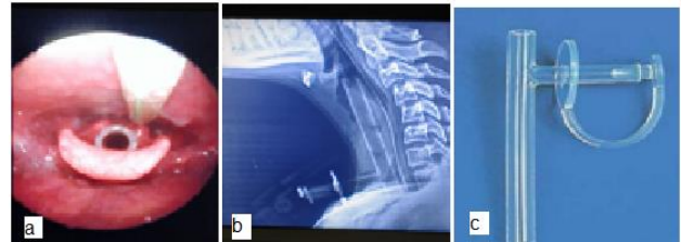
Figure 4 (a-c): Endoscopic picture showing laryngeal stent in situ, lateral radiograph of the neck showing laryngeal stent, silicone laryngeal stent used to prevent glottic stenosis.

Postoperative subglottic stenosis was noted in 3 patients, 2 patients who underwent successful laser excision of stenotic segment while 1 patient had laryngeal stent placement for 3 weeks (Figure 4 a-c).