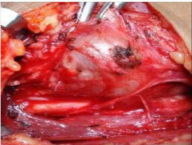
Figure 4: Identification of recurrent laryngeal nerve.

Next, the thyroid was retracted downwards and superior pole of thyroid identified the triangle. The superior vascular pedicle (Figure 2) could be easily identified in this technique allowing individual ligation of vessels and preservation of external laryngeal nerve. Once the middle