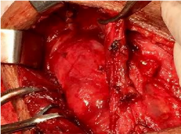
Figure 2: Identification of superior pedicle via lateral approach.