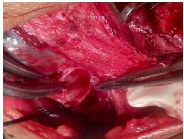
Figure 6: Ligation of inferior thyroid vessels.

The thyroid lobe was freed from its attachment to the ligament of Berry and underlying tracheal rings. For hemithyroidectomy, the isthmus was then transected (Figure 7) to complete the operation. For patients undergoing total thyroidectomy, similar dissection of the opposite lobe was performed after identifying and retracting the opposite SCM. Once both the thyroid lobes were fully dissected and freed from the overlying strap muscles, the smaller of the lobes could be easily pushed beneath strap muscles to the opposite site. Wash with