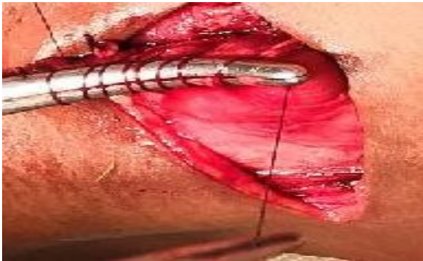
Figure 7: Ligation of thyroid isthmus in hemithyroidectomy.

warm normal saline is given and haemostasis is achieved by ligation and cauterisation. At the end of operation, the midline strap muscles cover over the trachea remained intact preventing adherence of skin flap to the tracheal cartilage. Drain was given and skin closed in layers. Sterile dressing was done and the patient was extubated. All total thyroidectomy specimens were removed intact in the LA group measured and sent for histopathological examination. Intravenous ceftriaxone and analgesia were given post operatively.