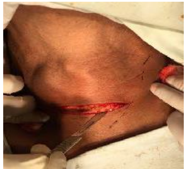
Figure 1: Horizontal skin incision 2 cm above suprasternal notch.

Under general endotracheal anaesthesia the patient was kept in supine position with gentle neck extension and arms stuck to patient's both sides with perfect alignment of the head and body for suitable placement of the incision and adequate anatomical exposure. Pre-operative shot of intravenous ceftriaxone was given and the parts were painted and draped in sterile manner.