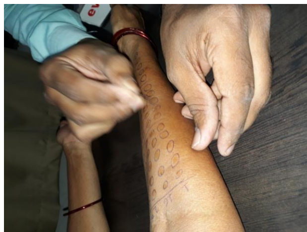
Figure 1: Performing SPT on volar aspect of forearm of patient.

Tests were applied to volar aspect of forearm, at least 2 to 3 cm from the wrist. The distance between 2 SPTs (>2 cm) was critical to avoid false positive results. Metal lancets or needles were the tools of choice for the test to allow small amount of allergen to be introduced in skin. Histamine and normal saline was used as positive and negative controls respectively. 56 allergens was tested on patient's body as the allergist watches for signs of an allergic skin reaction. The negative (-), positive (+), (+++) and (++++) results were assessed and analyzed.