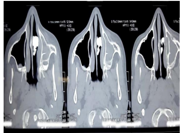
Figure 3: CT PNS axial view showing radio opaque foreign body.

This child was having history of 4 months foul smelling nasal discharge which was treated by paediatrician initially and then referred to the ENT surgeon. The child was treated conservatively by nasal drops and antibiotics without taking X-ray PNS/DNE examination. After 4 months, now she was evaluated here. On arrival, clinically there was a black irregular mass occupying both nasal cavities.