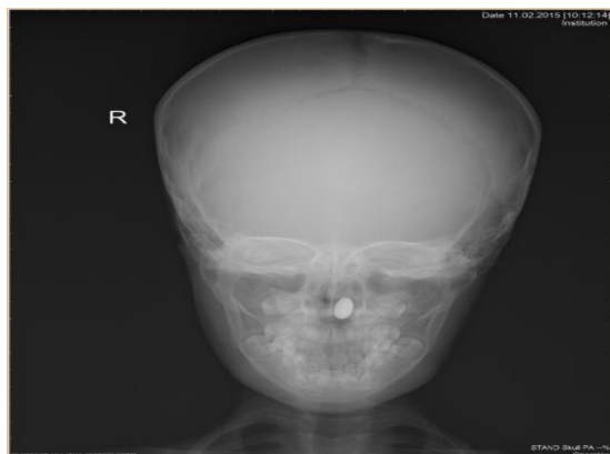
Figure 2: X-ray PA view of skull showing radiopaque foreign body with double rim appearance.

A 4 years old boy was referred from an ENT practitioner for evaluation of foreign body nose. There was the history of left sided nasal obstruction, blood stained nasal discharge and foul smelling for 10 days. History of unwitnessed foreign body in left nasal cavity was there. There was no history of fever or any other ENT symptoms. On examination, the child was conscious, alert and afebrile. The vitals were normal. On local examination of nose, there was blood stained discharge present in left nasal cavity. Right nasal cavity was free. On probing gritty sensation felt in left nasal cavity. X-ray PA view of skull showed radio-opaque foreign body with double rim appearance (Figure 2).