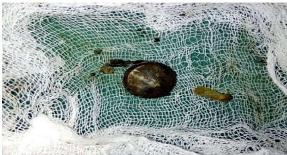
Figure 4: Picture showing the leaked button battery removed from nasal cavity.

After basic investigation patient was planned for an emergency foreign body removal by rigid esophagoscopy under general anaesthesia (Figure 6). Oesophagoscopy introduced per oral navigated to hypopharynx. The leaked button battery foreign body was found below cricopharynx which was removed by forceps. The leaked material was suctioned. No significant abnormality was observed. The procedure uneventful. Ryles tube was inserted. Patient recovered from general anaesthesia and extubated. Postoperatively, a paediatric physician's evaluation also was done. Nil significant complaints were received. Patient was discharge on the 4 th post-operative day.