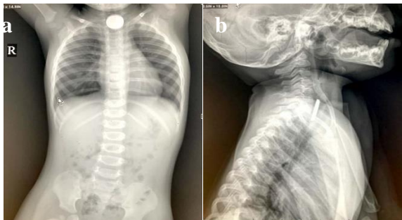
Figure 5 (a and b): X-ray STNL showing double rim appearance - the significance of button battery.