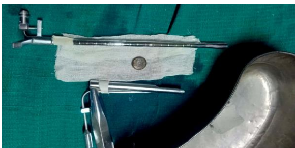
Figure 6: Button battery removed by rigid pediatric esophagoscopy.