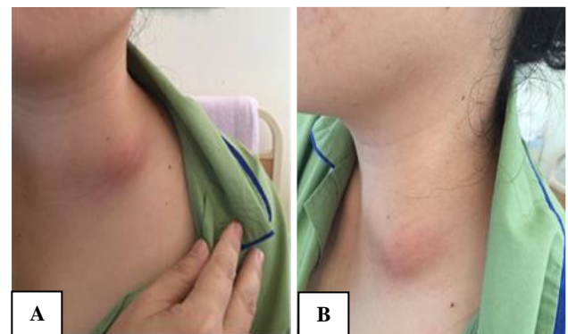
Figure 1: (A) Anterior view, (B) lateral view.

complaint of left neck swelling for 1 month. It was gradually increasing in size and associated with pain. There were no other constitutional symptoms. Clinical examination revealed a 4×3 cm circular swelling at level IV, fluctuant, erythematous and tender on palpation (Figure 1 A and B).