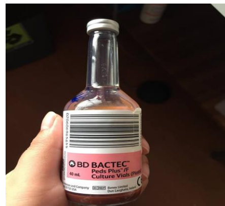
Figure 4: BD BACTEC paediatrics bottle.

On examination of the neck, noted swelling over left neck at level II measuring 2x1cm, fluctuant, tender on palpation with erythematous skin changes (Figure 3).