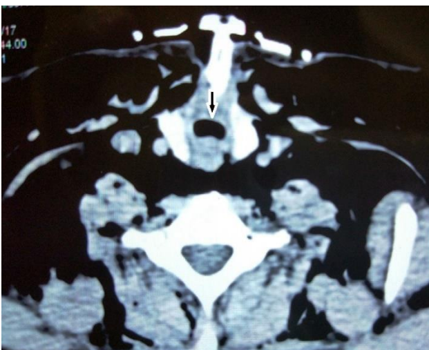
Figure 2: CT scan of neck showing stenosis (arrows)-axial view.