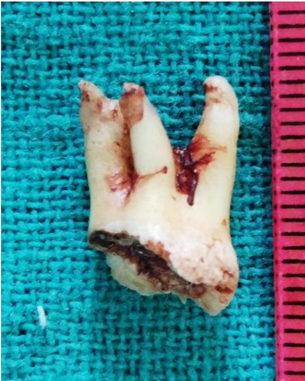
Figure 1: Foreign body (tooth) removed from trachea.

Post tracheostomy her saturation was 99% on room air and was stable. Careful and detailed history in retrospect revealed tooth extraction 6 months back following which she developed dyspnoea and later progressed to stridor. Histopathology of polypoidal tissue revealed granulation tissue. She was given intravenous prednisolone for one week and a computed tomography (CT) scan was done which revealed tracheal stricture of around 2 mm thick and 2 cm below the level of vocal cords, covering around 70% of the lumen (Figure 2-3). FOL was repeated which confirmed the radiographic findings.