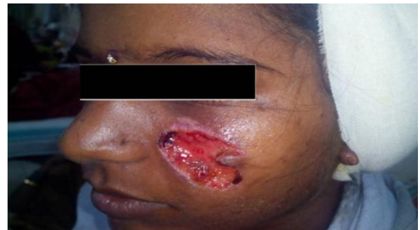
Figure 7: Pre-operative photograph.