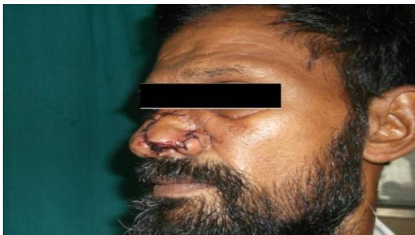
Figure 4: Post-operative photograph day 6.