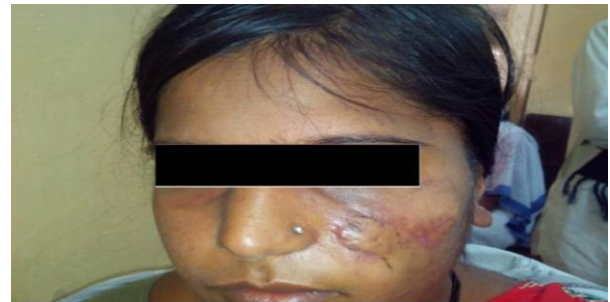
Figure 8: Post-operative photograph after 6 weeks showing VSS of scale 5 (hyperpigmentation-2, pink-1, supple-1, <2 mm- 1).