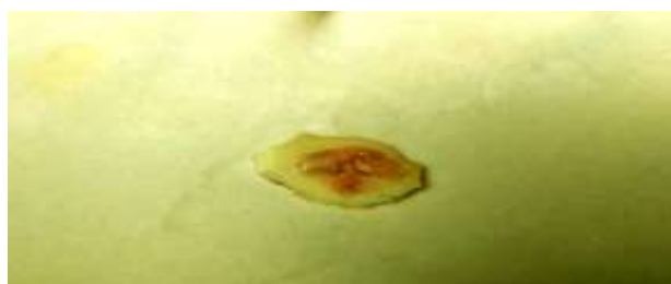
Figure 2: The perichondrium is elevated from the underlying cartilage all around at the edges about a distance of 2 mm from the edges.