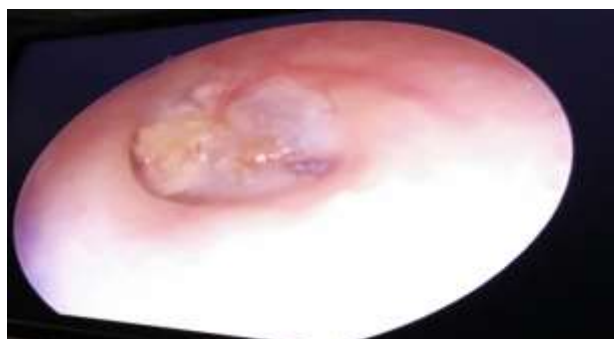
Figure 4: Oto-endoscopic finding at the end of 6 months follow-up showing complete closure of the tympanic membrane perforation.