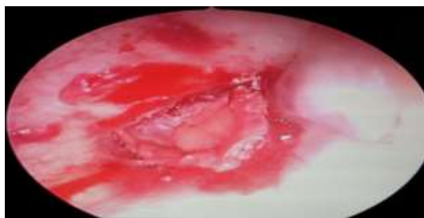
Figure 3: The cartilage graft is inserted through the perforation such that the cartilage part becomes underlay and the perichondrium becomes overlay on the tympanic membrane remnant.